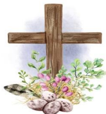
HE IS RISEN!

The Drama Club's Production of Mamma Mia! will be held at the school on Thursday, April 27th, at 7:00 PM; Friday, April 28th, at 7:00 PM; Saturday, April 29th, at 7:00 PM; and Sunday, April 30th, at 2:00 PM. Tickets are available on Nativity's Facebook page (Nativity Athletics and Events) or at the door each night of the show.